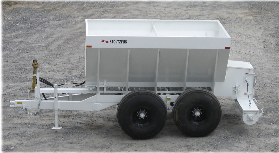
Model SSOT 80